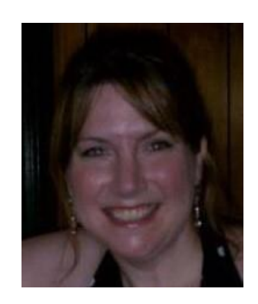
Transformation by Design